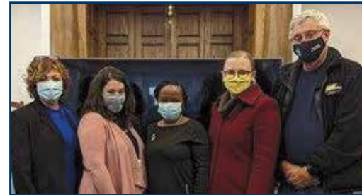
It's always a pleasure to work with Beth El-Ner Tamid. My office gladly participated in their feminine hygiene product drive to help address period poverty here in Delco.